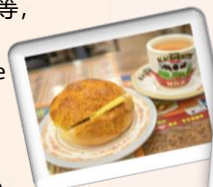
冰室/茶餐厅 Cha Chaan Teng (HK Style Cafe)

Enjoy the delicacies in Kowloon City, from Canton style BBQ meat, Hong Kong style cafes, Thai cuisine to modern cafés.