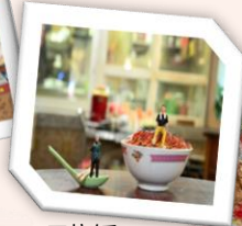
叉烧饭 Char Siu Rice (BBQ Pork Rice)